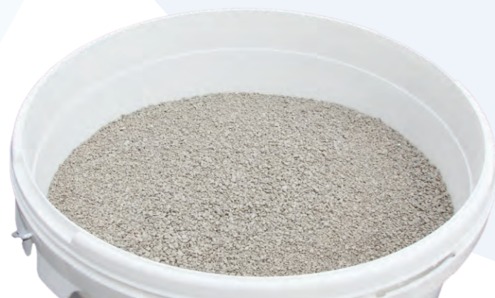
Advanced Granular Media (AGM)

Our engineered Advanced Granular Media (AGM) is a specially formulated organoclay and has extremely high adsorption properties that remove emulsified oil, grease and low soluble organic compounds from waste water streams. The AGM is very efficient due to the large surface active areas and can adsorb up to 60% of its own weight in organic contaminants, in comparison to only 2-5% for granular activated carbon. Designed to be quick acting, the AGM is both hydrophobic and oleophilic making it extremely effective. This remarkable adsorption can produce continuous and reliable effluent below 5ppm. With no cleaning cycles, no back wash discharges and no extra downtime for replacements or the use of chemicals, means running costs for our system are kept to a minimum.